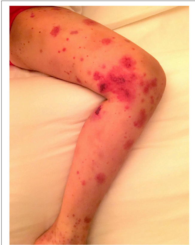
FIGURE 2 | IgA vasculitis presenting in a child illustrating areas of petechiae, purpura, bruising, and necrotic lesions on the limb (parental consent obtained).