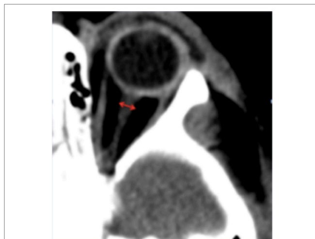
FIGURE 3 | Representative computed tomography image of a pediatric patient showing measurement of the ONSD. The ONSD is typically measured 3 mm behind the insertion of the optic nerve into the globe, perpendicular to the long axis of the optic nerve.