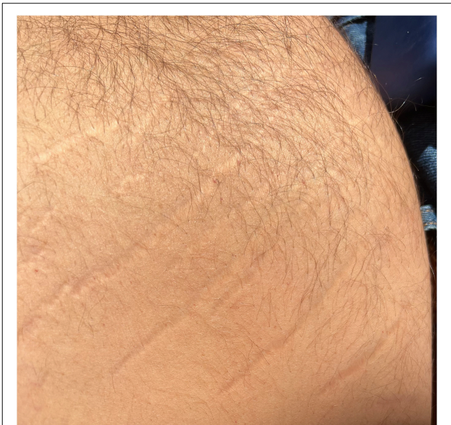
FIGURE 2 | Striae distensae (stretch marks) on the trunk of a patient with obesity.