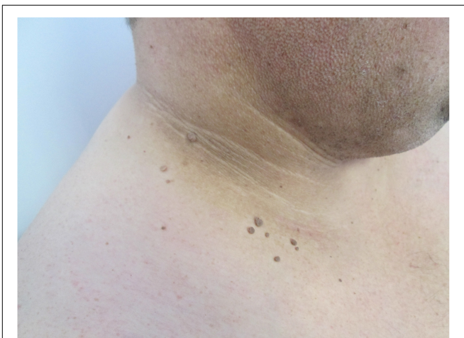
FIGURE 3 | Acanthosis nigricans presented with velvety, brown plaques, and skin tags (fibroma pendulum) on the neck of the patient.

from the obligatory paraneoplastic acanthosis nigricans (22). Weight reduction, topical retinoids, keratolytic agents, and agents targeted against insulin resistance have been shown to be effective in the treatment of this condition (23).