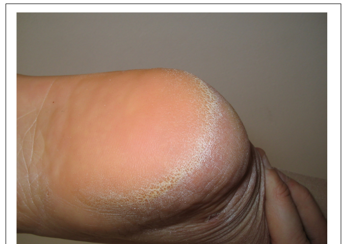
FIGURE 1 | Horseshoe-like plantar hyperkeratosis of the heel.

Insulin resistance, a common finding in obese patients (20), has been shown to induce specific skin changes. Acanthosis nigricans ( Figure 3 ), which presents with velvety pigmented and verrucous plaques on the skin folds (neck, axilla, inguinal, and sub-mammary), results from the stimulation of the proliferation of dermal fibroblasts and epidermal keratinocytes by insulin, insulin-like growth factor 1 (IGF1), fibroblasts, and epidermal growth factors (8, 21). This condition should be distinguished