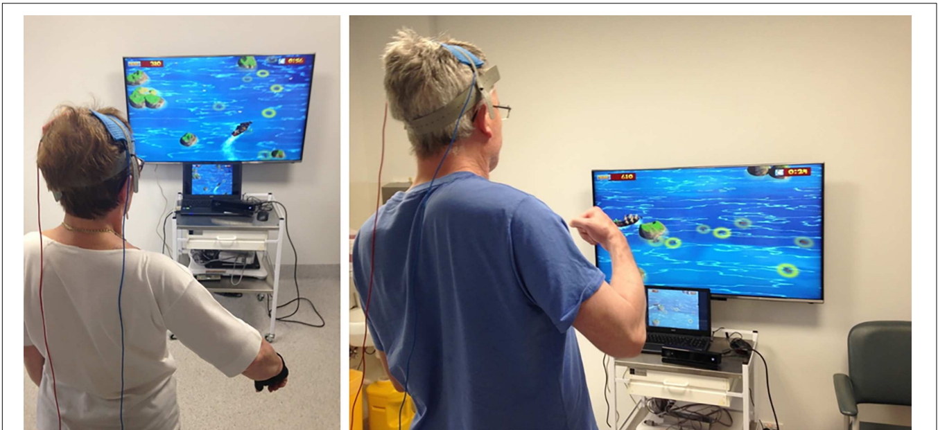
FIGURE 2 | Stroke participants engaged in VR therapy using an X-Box Kinect motion capture system while receiving tDCS.

location and level of activation, for which clinicians and users can use to set intensity and progression of therapy. Furthermore, feedback on cortical activation can also be used to identify areas of hypo- or hyperactivity, which can be modulated using neuromodulatory techniques such as tDCS (see Prospective Integration of Neuromodulation-Neuroimaging with VR Therapy). In support of the second role, identifying cortical areas of activation, patterns and timing of cortical activation associated with various movements or mood states may also be recorded as classifiers for BCI training. Indeed, most BCI studies to date have employed the use of EEG as a measure for cortical activation for which to control a robotic limb or avatar in a VR environment (Lin et al., 2007; Formaggio et al., 2013, 2015). Although relatively new, there are also fNIRS-based BCI approaches demonstrating feasibility for future integration with VR and neurorehabilitation (Sitaram et al., 2007; Hong et al., 2015). Moreover, joint use of fNIRS- and EEG-based BCI approaches have also been demonstrated (Koo et al., 2015; Xuxian et al., 2015). This shows the potential to adopt fNIRS in a similar manner, whereby appropriate cortical hemodynamic responses can be classified to control a robotic or computer interface.