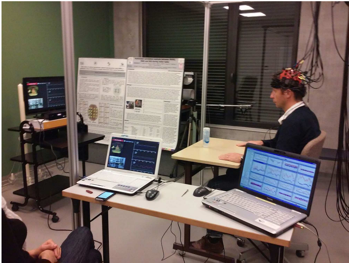
FIGURE 3 | The use of a semi-immersive VR environment and fNIRS system.

the significance of these neurophysiological improvements to clinical outcomes.