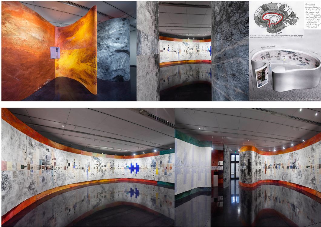
FIGURE 1 | “The Brain Theater of Mental Imagery with Thought Assemblies emerging from the Limbic System,” (1979–82, 2014). Mixed media on synthetic canvas with collage elements, 11 ft. x approx. 145 ft. perimeter x 37 ft. diameter. Installation view:

CU Art Museum, University of Colorado Boulder (Courtesy of the CU Art Museum. Photo: Jeffrey Wells). (Pictures of “Thought Assemblies” courtesy of The Picower Institute for Learning and Memory, MIT Art Collection).