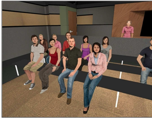
FIGURE 2 | Virtual audience with participant's avatar reflection at the back of the classroom during the speech.

take off the HMD. Finally, they completed a post-survey and were thanked for their participation.