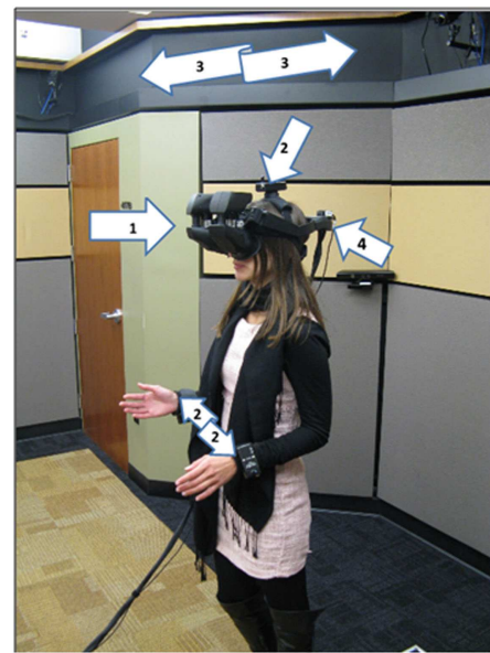
FIGURE 3 | Participant wearing the HMD (1), tracking sensors on the head and wrists (2), cameras (3) to detect the position of the trackers, and orientation device (4), during the speaking task.

In addition, trait social anxiety was measured using the Brief Fear of Negative Evaluation Scale (B-FNE; Leary, 1983). This scale is often used to assess fear of negative evaluation, the core feature of social anxiety disorder (Weeks et al., 2005). This measure yielded a reliability of \alpha = 0.86 and the average score was M = 3.26 ( SD = 0.64 ). B-FNE scores were not significantly different across conditions: M_{\text{self}} = 3.33 , M_{\text{other}} = 3.15 , M_{\text{choice}} = 3.29 ( SD_{\text{self}} = 0.64 , SD_{\text{other}} = 0.65 , SD_{\text{choice}} = 0.65 ); X^2_{df=2} = 1.5 , p = 0.48 based on Kruskal-Wallis test (residual errors not normally distributed).