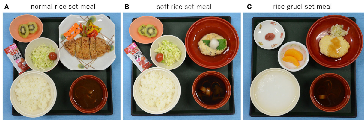
FIGURE 1 Japanese set meals. (A) Normal rice set meal. (B) Soft rice set meal. (C) Rice gruel set meal.