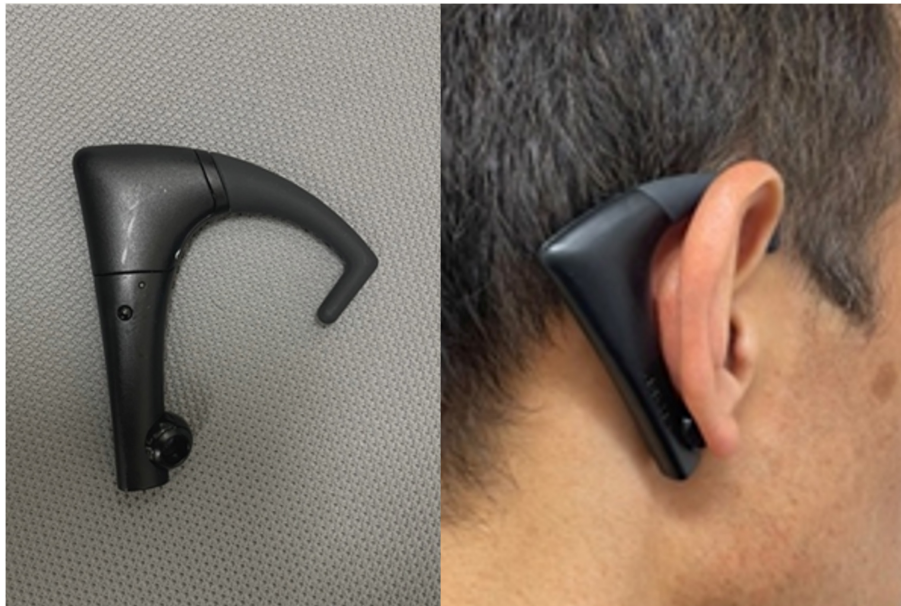
FIGURE 2 Bite scan ® to measure the number of chews, mealtime, and chewing speed.

The chewing movement was measured using a waveform detected on the back of the ear (Figure 2). The number of chews, elapsed mealtime, and chewing speed were measured using the Bitescan ® (15). This wearable device has an infrared distance sensor and accelerometer and scans the morphological change in the skin surface on the posterior side of the pinna during chewing exercise, at 20 Hz. This device is designed to be worn on the right side and has an adjustable ear hook (Figure 2). The participants wore the Bitescan ® on the back of the pinna, and it was wirelessly linked to a smartphone (SHM05; Sharp Co., Sakai, Japan) via Bluetooth. The Bitescan ® identified chewing movement from the algorithm installed on the smartphone application which determines chewing based on an individually