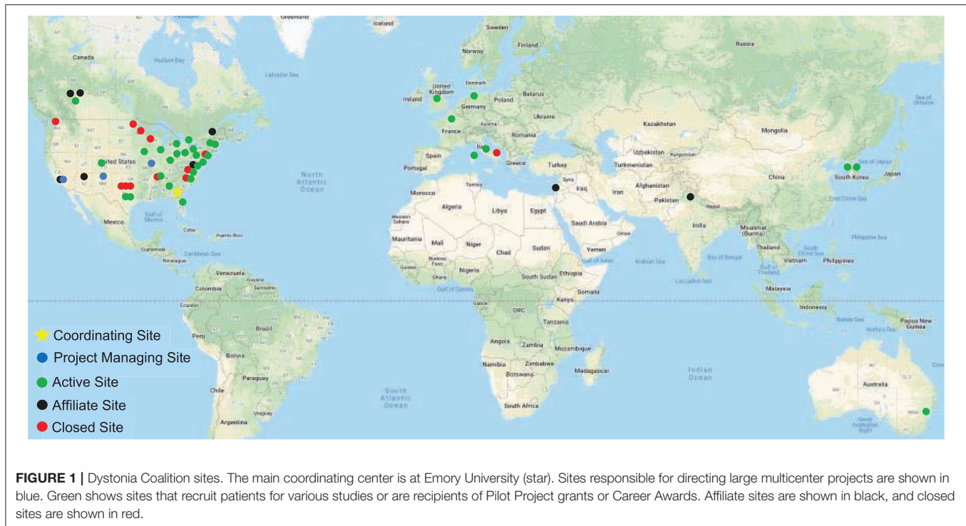
FIGURE 1 | Dystonia Coalition sites. The main coordinating center is at Emory University (star). Sites responsible for directing large multicenter projects are shown in blue. Green shows sites that recruit patients for various studies or are recipients of Pilot Project grants or Career Awards. Affiliate sites are shown in black, and closed sites are shown in red.

DC; it is open to all academic investigators and their staff, PAG members, and representatives from NIH, and industry.