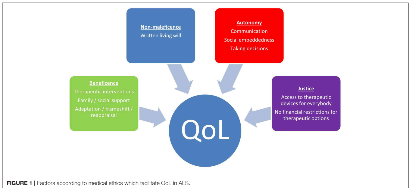
FIGURE 1 | Factors according to medical ethics which facilitate QoL in ALS.

Patients can be encouraged to use these inner resources mentioned above. Psychotherapeutic interventions may help to improve the QoL of patients and may even prolong survival as the psychoemotional state of the patient has impact on QoL (50) and survival time (49). The beneficence of the above mentioned