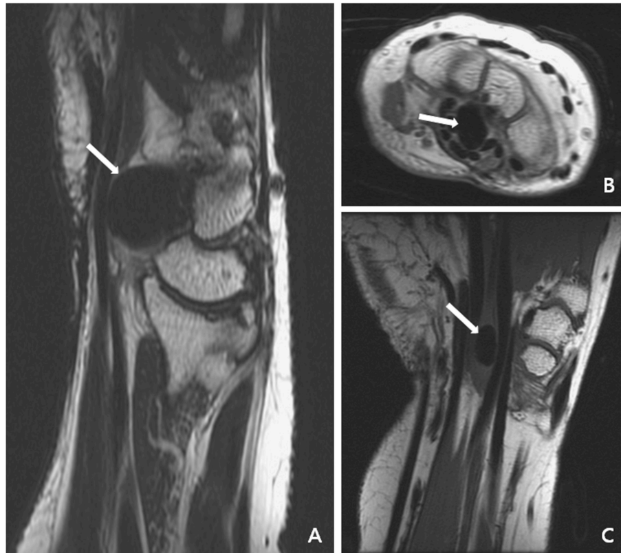
FIGURE 2 | Magnetic resonance imaging of the first patient disclosed focal lower intensity of the nodular lesion (white arrow) without obvious contrast enhancement. (A) Sagittal plane of T2- and T1-weighted images. (B) Axial plane of T1-weighted image with contrast. (C) Coronal plane of T1-weighted image.

of the wrist (9). The incidence of patients with unilateral CTS is higher than that of patients with bilateral CTS. A retrospective study (9) conducted in 2009 accumulated 324 cases of CTS and conducted routine radiographs for a survey; the results revealed a higher incidence of patients with unilateral CTS (12.5%) than of those with bilateral CTS (0.4%). Likewise, another retrospective study reviewed 128 cases of CTS and divided them into three groups: bilateral, subclinical, and unilateral CTS; the study reported no space-occupying lesion-related CTS in the bilateral or subclinical CTS groups; however, a significantly higher incidence of space-occupying lesion was noted in the unilateral CTS group (2).