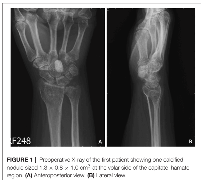
FIGURE 1 | Preoperative X-ray of the first patient showing one calcified nodule sized 1.3 \times 0.8 \times 1.0 \text{ cm}^3 at the volar side of the capitate–hamate region. (A) Anteroposterior view. (B) Lateral view.

A careful physical examination should be initially performed for establishing an accurate diagnosis. Identification of a space-occupying lesion becomes easy when the nodule is palpable and presents as swelling and local tenderness over the flexion crease