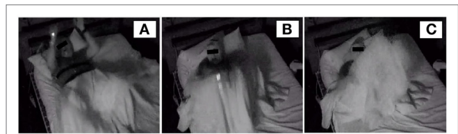
FIGURE 1 | Video EEG screenshots of sleep-related hypermotor epilepsy patient. (A) Bilateral hand raising, leg flexion, and moaning. (B) Yelling and abrupt sit-up. (C) Forceful lay back and bilateral pedal kicking.

Video EEG allowed for the semiologic diagnosis of SHE. He was initiated on and titrated to a therapeutic dose of oxcarbazepine, a