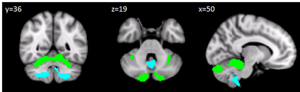
FIGURE 2 | Between-group voxel-based comparison of cerebellar GM density. Cerebellar regions showing patterns of significantly reduced GM in CB compared to HS are reported and superimposed on the Spatially Unbiased Infratentorial Template (SUIT) (Diedrichsen et al., 2009) in coronal ( y = 36 ), axial ( z = 19 ) and sagittal ( x = 50 ) slices. Clusters of significantly decreased GM in the cerebellum are shown in green (cluster size: 343334) and light blue (cluster size: 11568). The results significant at p -values < 0.05 after family wise error (FWE) cluster-level correction. Images are shown in radiological convention.