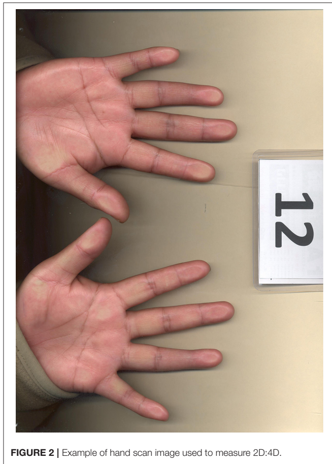
FIGURE 2 | Example of hand scan image used to measure 2D:4D.

Eight raters were instructed and received guidance on using the Autometric software (DeBruine, 2004) designed to measure digit ratios. They then independently measured both hands for each image in all five batches. The order in which each rater received the five batches was randomized.