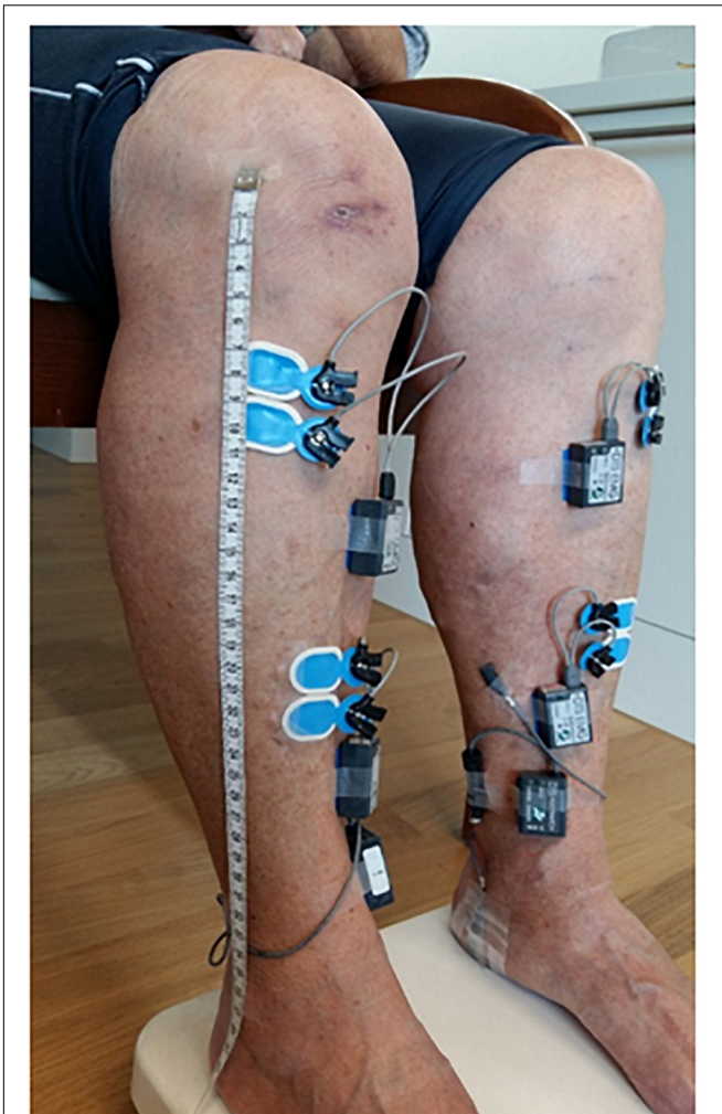
FIGURE 2 | Placement over both tibialis anterior muscles of a pair of bipolar EMG electrodes using an inter-electrodes distance of \sim 2 cm in each bipolar set and a distance of \sim 10 cm between the two bipolar set of EMG electrodes to reduce the risk of cross-talk. Footswitches placed over the midpoint of each heel were placed in order to record heel-strike events during the overground gait trials.

to the preceding 400 ms. The preprocessed EMG data segments were subsequently down-sampled to 500 Hz.