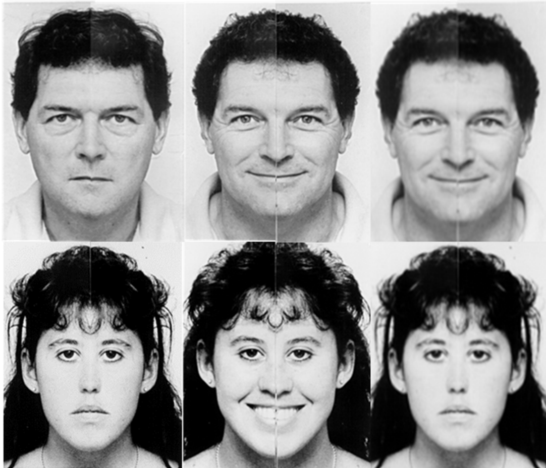
FIGURE 1 | Examples of the emotional valence determination test (EVDt). EVDt examples in response to the question: “Are the emotions the same?” (left) “yes”; two neutral faces. (center) “yes”; two happy faces. (right) “no”; happy (top) and neutral (bottom).

For “presentation of stimuli scenarios” (i.e., when the participant was shown two happy faces, two neutral faces, or one of each)—brain activity from the first 2 s following the presentation of a stimulus was recorded for each trial. In the event a participant responded within <2 s, the interval between the presentation of the stimulus and 250 ms before the response was used for the recording interval. This was done to avoid brain activity artifacts related to the button press. Instances where a participant made no response before the presentation of the next stimulus were discarded.