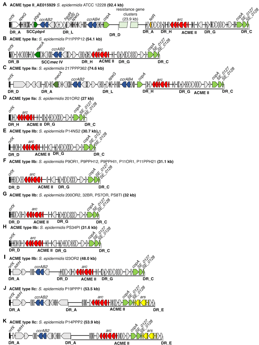
FIGURE 2 | Schematic representation of ACME II subtypes a-c and ACME type II-harboring Cls investigated in the present study. The previously described ACME type II Cl harbored by the S. epidermidis reference strain ATCC12228 (Genbank accession number AE015929) is included for reference ( A ). The size of each ACME is shown after the strain name. Each gene or group of genes of interest is differentiated by a different color, i.e., red; arc -operon, pale green; mustard; tetR , cop -operon, yellow; ars operon, dark blue; ccrAB genes, dark green; mecA , dark gray; speG , light gray; genes encoding hypothetical proteins, sugar transporters, transposases and other ORFs, previously identified in ACMEs. The direction of transcription for each ORF is indicated by the arrow. The DRs are indicated in bold font and correspond to each DR sequence listed in Table 3 .

et al., 2017). The CI harbored by the fourth isolate (I1PPP121) consisted of two distinct modules separated by DR_G ( Figure 3 ). The module at the 5' end harbored two pairs of ccr genes, of which