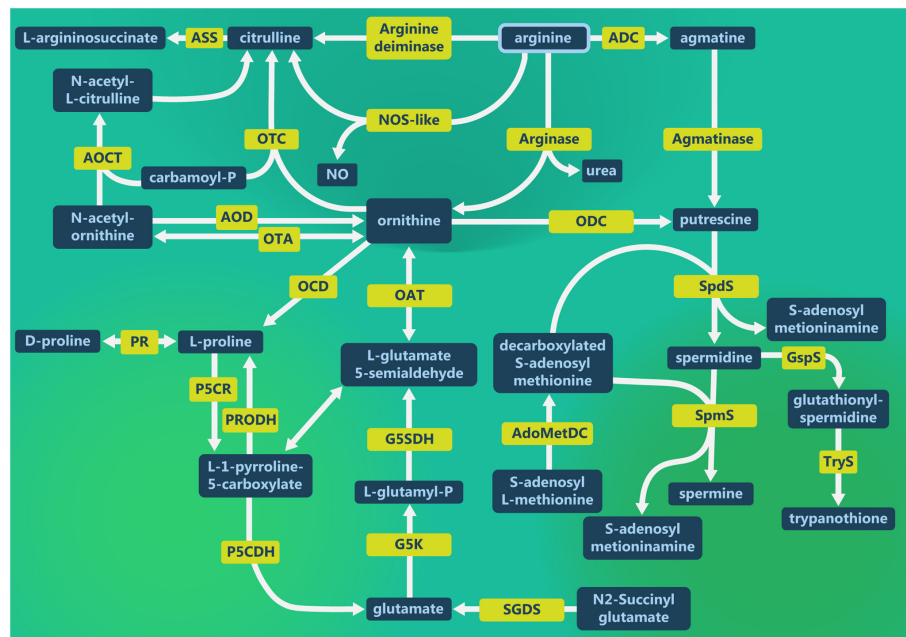
FIGURE 1 | Leishmania L-arginine metabolism. L-arginine metabolic pathways in Leishmania to produce polyamines as well as the interconnection with glutamate and proline metabolism. L-arginine supplies citrulline and nitric oxide (NO) production. Ornithine supplies proline, glutamate and putrescine production, as well as the interconversion of glutamate, proline and ornithine. Putrescine is the first polyamine that can form spermidine and spermine, essential for parasite growth. Spermidine is the substrate for spermine and trypanothione production. ADC, arginine decarboxylase; AOCT, N-acetylornithine carbamoyltransferase; AOD, acetylornithine deacetylase; AdoMetDC, adenosylmethionine decarboxylase; ASS, argininosuccinate synthase; G5K, glutamate 5-kinase; G5SDH, glutamate-5-semialdehyde dehydrogenase; GspS, glutathionylspermidine synthase; NOS-like, nitric oxide synthase-like; OAT, ornithine aminotransferase; OCD, ornithine cyclodeaminase; ODC, ornithine decarboxylase; OTA, ornithine transacetylase; OTC, ornithine transcarbamylase; P5CDH, pyrroline-5-carboxylate dehydrogenase; P5CR, pyrroline-5-carboxylate reductase; PROD, proline dehydrogenase; PR, proline racemase; SGDS, succinylglutamate desuccinylase; SpdS, spermidine synthase; SpmS, spermine synthase and TryS, trypanothione synthase.

BALB/c macrophages infection was observed in L. amazonensis (Muxel et al., 2017). These data reinforce the existence of different modulation of ARG expression under environment conditions, such as axenic cultivation of parasites.