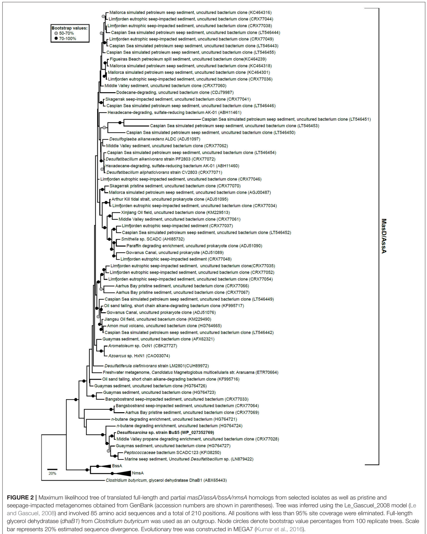
FIGURE 2 | Maximum likelihood tree of translated full-length and partial masD/assA/bssA/nmsA homologs from selected isolates as well as pristine and seepage-impacted metagenomes obtained from GenBank (accession numbers are shown in parentheses). Tree was inferred using the Le_Gascuel_2008 model (Le and Gascuel, 2008) and involved 85 amino acid sequences and a total of 210 positions. All positions with less than 95% site coverage were eliminated. Full-length glycerol dehydratase ( dhaB1 ) from Clostridium butyricum was used as an outgroup. Node circles denote bootstrap value percentages from 100 replicate trees. Scale bar represents 20% estimated sequence divergence. Evolutionary tree was constructed in MEGA7 (Kumar et al., 2016).