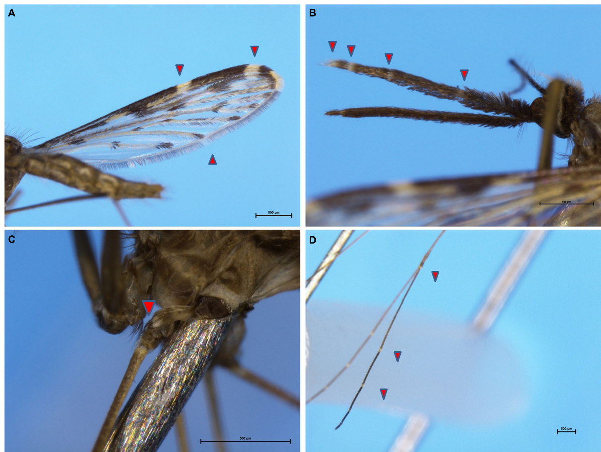
FIGURE 2 | Typical morphological characteristics of An. sinensis . (A) A pale fringe spot at vein 5.2. (B) Four pale bands on the palpi. (C) Patch of pale scales at midcoxa. (D) Apical pale bands at hindtarsomeres.

time was 13.74 days occurred in the Henan province (Qu et al., 2000d). The time required for the development of An. sinensis was temperature dependent. Wang et al. (2010) documented a shortened duration as the temperature increased from 16 to 31°C. The life cycle duration were 30.7, 23.3, 15.5, 13.5, and 12.5 days at 19°C, 22°C, 25°C, 28°C, and 31°C respectively. An. sinensis can complete their development at temperatures as low as 16°C (Sun et al., 1994), but cannot develop successfully at temperatures > 31°C. In contrast, An. gambiae s.s. development was fastest between 28 and 32°C; adults did not emerged at <18°C or >34°C (Kirby and Lindsay, 2009). Development time from egg to adult was also largely temperature-dependent.