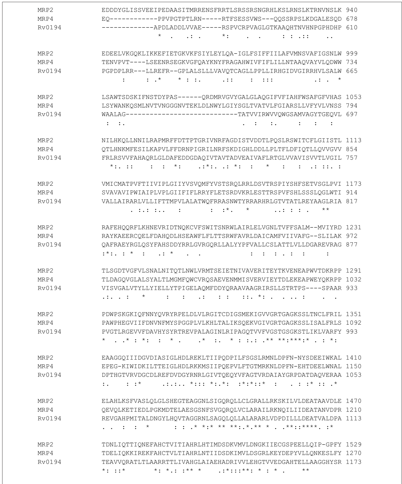
FIGURE 3 | Sequence Alignment of MRP2, MRP4, Rv0194 with ClustalW2. http://www.ebi.ac.uk/Tools/msa/clustalw2/ .