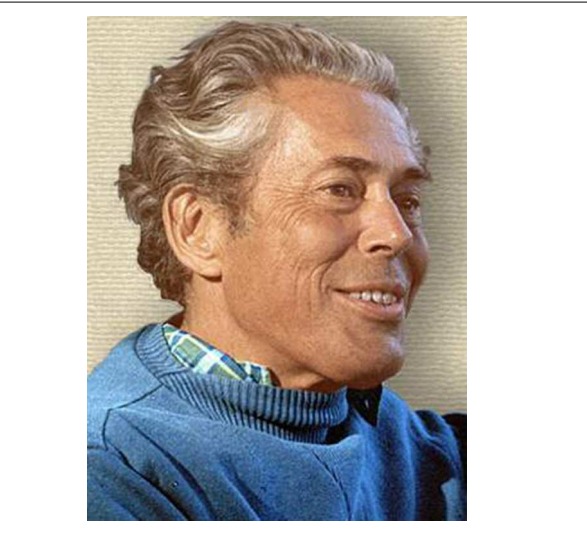
FIGURE 2 | Jacques Monod (1910–1976).