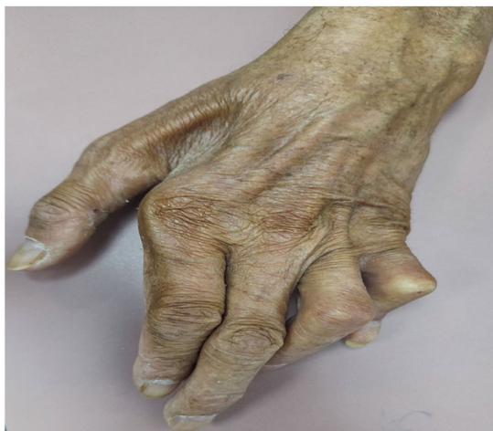
FIGURE 1 Brazilian male patient, diagnosed with leprosy, presenting with polyarthrititis and deformities.

Modified from Chauhan et al. (8). PIP, proximal interphalangeal; MCP, metacarpophalangeal; MTP, metatarsophalangeal.