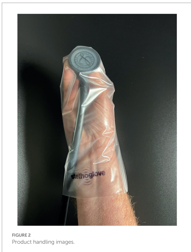
FIGURE 2 Product handling images.

The mean rating of the acoustic quality of auscultations with the SC by all users was 4.2 ± 0.7 (Median 4.0; range 2–5) on a 5-point Likert scale (Table 3). A total of 86.1% of all auscultations with the SC were rated at least “good” (score of 4 or higher) with comparable results across user groups ranging from 88.3% for fully trained physicians (group 1), 85.1% for physicians in speciality training (group 2), 87.5% for nurses with 10 or more years of professional experience (group 3), and 83.1% for nurses with less than of professional experience (group 4), respectively (Table 3; Figure 3). No auscultation was rated as “poor” (score of 1). For two out of 534 auscultations no rating was recorded.