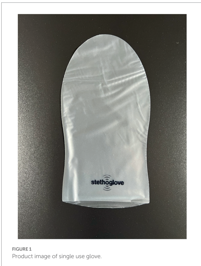
FIGURE 1 Product image of single use glove.

The continuous parameter “rating of the acoustic quality during auscultation measured on a 5-point Likert scale (poor, moderate, reasonable, good, very good)” was used as primary performance endpoint. No verification of a pre-defined hypotheses was planned. Instead, a total of 508 recorded auscultations with the SC was calculated to be required based on the following assumptions: a sampling error of 5% (precision), a prognostic accuracy of 95%