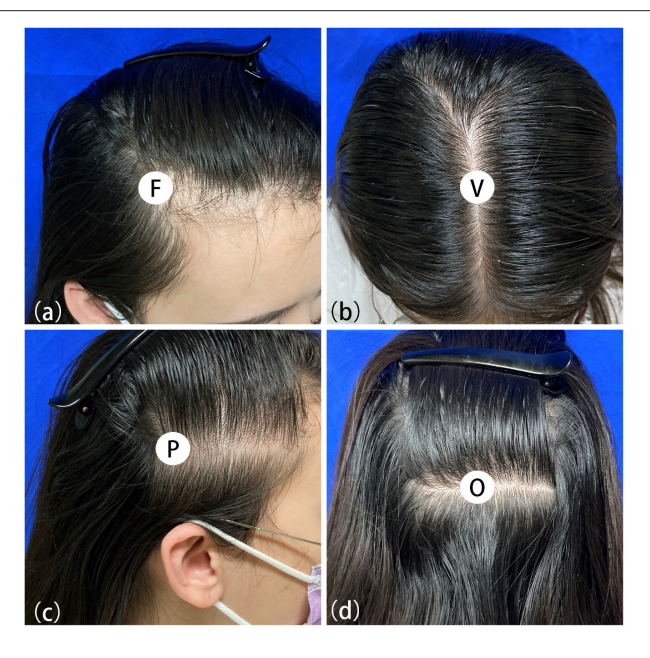
FIGURE 1 | Measuring points of trichoscopy in frontal (a), vertex (b), parietal (c) and occipital (d) area.

dragging vertically from one edge of the hair shaft to the other edge, and the average value was calculated.