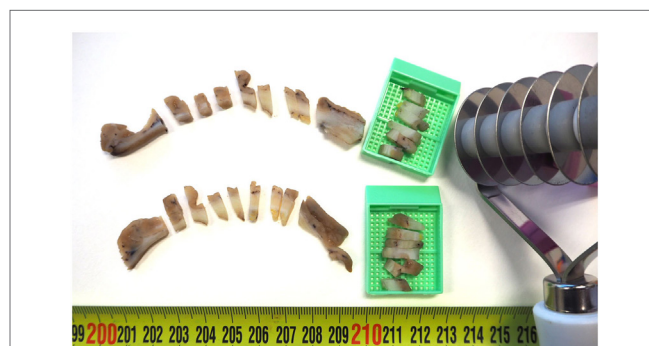
FIGURE 1 | Practical implementation of multisite tumor sampling in a gastric adenocarcinoma (GAC). Two slices of a GAC after the application of multi-wheel rolling pasta cutter obtaining multiple tumor bars that include the full thickness of the tumor (including the front of tumor invasion) that fit six of them in the same cassette (the patient gave written informed consent for the use of this biological material for scientific purposes).

Our accumulated experience with MSTS points to this method as the most affordable sampling strategy in large tumors to guarantee a proper ITH detection without increasing cost. It seems, however, that MSTS must be adapted to the tumor shape, on the one hand, and to the tumor topography, on the other hand. Tumors growing as 3D spheroids like those arising in the kidney, liver, lung, breast, and soft tissues, for example, are not confined by anatomical barriers and are well sampled with tissue cubes, as recently shown (11). However, tumors with more or less flattened shapes, arising in hollow viscera, are confined by well-defined anatomical barriers, namely, muscularis propria. In this context, MSTS must take into account the tumor orientation for sampling to get information at different levels of the wall. Obtaining tumor bars including (if possible) the whole tumor thickness is the best option for these cases.