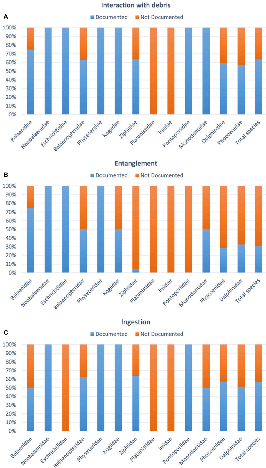
FIGURE 1 | Percentage of studied species for debris in relation to the total number of species per family in the order Cetaceans. (A) Interaction with debris including both entanglement and ingestion; (B) percentage of species with documented/not documented entanglement; (C) percentage of species with documented/not documented ingestion.