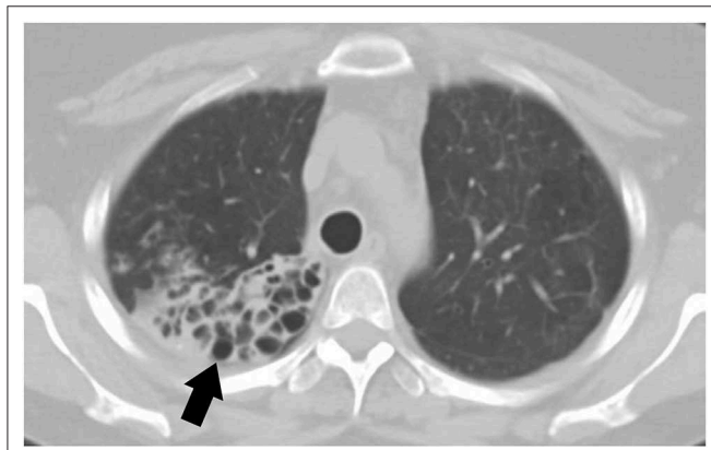
FIGURE 2 | CT scan of a 44-year-old female with primary Sjögren's syndrome demonstrating bronchiectasis on the right lower lobe.

cough, or isolated dyspnea. In rare occasions patients can also have hemoptysis likely due to exacerbation of bronchiectasis. Patients with bronchiectasis also had increased respiratory infections and pneumonia (80).