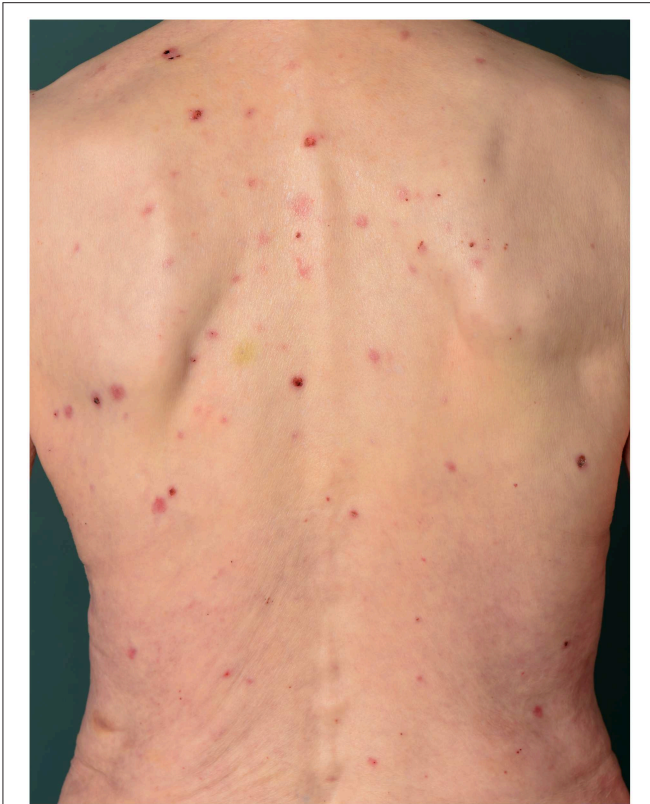
FIGURE 1 | Seventy-eight-year old female patient with BP. Excoriations, bleeding and crusts caused by scratching can be observed.

The current therapy recommendations do not outline specific antipruritic therapies besides the immunosuppressive therapies (52). Pruritus parallels the disease course in BP. Accordingly, cessation of pruritus is one criterion of disease control in BP (49) and monitoring of pruritus is an important step which can be done using the Subjective Bullous Pemphigoid Disease Area Index pruritus score (49). For patients with impaired mental functioning, indirect assessment of pruritus via presence of signs of scratching and sleep disturbance is suggested (49).