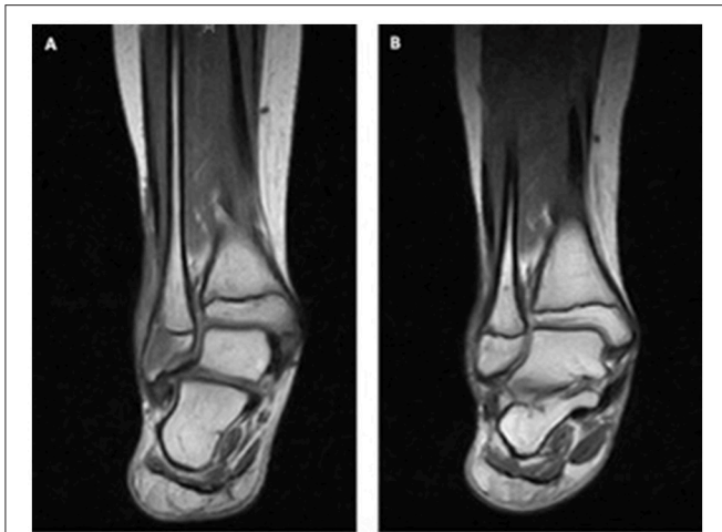
FIGURE 3 | Granulomas in the bone of patient 7. MRI (A) at the beginning and (B) after 1 year of TNF inhibitor treatment.