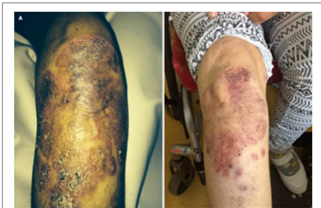
FIGURE 4 | (A) Massive skin granuloma in patient 5 and (B) regression of granuloma under TNF inhibitor treatment in patient 5 after 1.5 years.