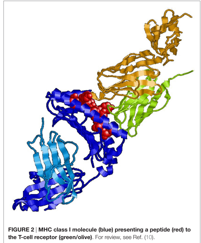
FIGURE 2 | MHC class I molecule (blue) presenting a peptide (red) to the T-cell receptor (green/olive). For review, see Ref. (10).

the view of the immune system, will be used as the metrics of the epitope dimension.