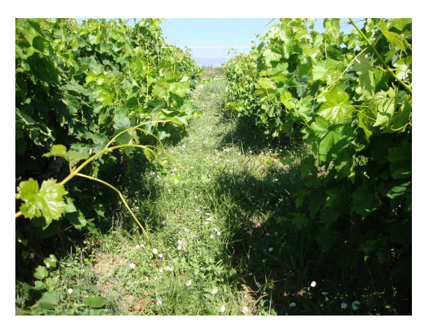
FIGURE 5 The intercrop spaces of 'Sultanina' vineyards in Perigiali, Corinth, (Greece) where the spontaneous wildflowers were not cut during spring providing shade from the extremely strong effect of the sun on the grapes.

recent Directive of the EU Common Agricultural Policy (CAP) (EU Commission, 2021) promotes the establishment of meadows aimed at the conservation of pollinators, in accordance with the list of species that each country needs to provide, and imposes non-mowing during the active period of pollinators (spring to autumn). Finding sufficiently large amounts of seeds on the seed-market to cover farmlands, especially for organic farms that need organically-produced seeds, is still critical.