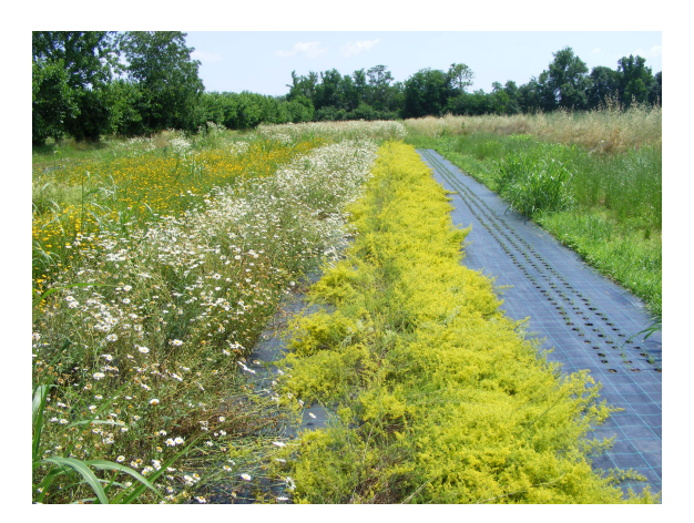
FIGURE 7 Native wildflower seed production for commercial purposes, the company is based in Udine (Italy). The cultivation of wildflower species is carried out in monospecific plots, and later assembled in adequate percentages to obtain the mixes.