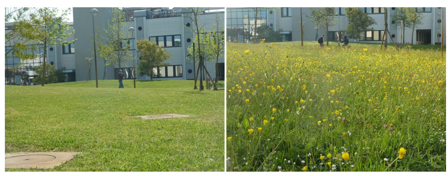
FIGURE 9 Reducing the mowing of turf in spring, surprisingly, turns what has been defined as a "green desert" into a rich habitat which, allowing abundant flowering of the dicotyledonous species, provides food and shelter to insects, amphibians, and birds, and provides a pleasant sensory experience for people.

Planting meadows in anthropogenic landscapes, urban and rural areas, compensates for the loss of habitats for pollinators and the food web, offers a conservation opportunity for many plant species, and provides the possibility for people to enjoy nature and citizen science programs. Meadow vegetation provides many ecosystem services, which are now more necessary than ever for a healthy life on the planet. The methods used for establishing wildflower meadows have been widely investigated in northern Europe and America, and now studies are being carried out in different climatic regions such as the Mediterranean. The connection to the geographical area is key if conservation is a primary aim. Constraints are represented by the difficulties in finding the germplasm, as in many countries the seed market is not yet ready to offer the most appropriate materials, i.e. seeds of