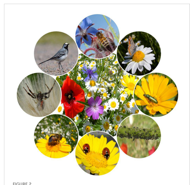
Wildflower meadows support the food web, attracting pollinators, birds, and small animals.