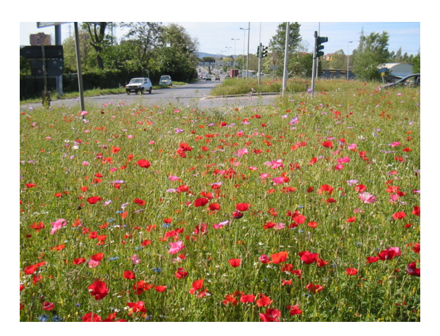
FIGURE 4 The pedological conditions of many urban degraded sites such as roadsides are suitable for wildflower meadows to thrive. The figure shows a roundabout in Livorno (Italy) with a sown-on-purpose mix of wildflowers.

Wildflower meadows can also help reconcile conservation needs with the demands of the local population for aesthetically pleasing spaces. These spaces can be used for wider community participation, socializing, recreation, and education. Sometimes the presence of exotic plant species, with a long-lasting, high visual impact, increases the benefits to human wellbeing (Vega et al., 2021), and non-native plant species often offer further food resources for pollinators (Kovács-Hostyánszki et al., 2022). Consequently, the presence of non-native plant species in a commercial wildflower mix in the right context (e.g., urban pollinator habitat) is acceptable in cases where a local product cannot be found on the market (Barry and Hodge, 2023). Only a few studies have evaluated the use of non-native wildflower species for