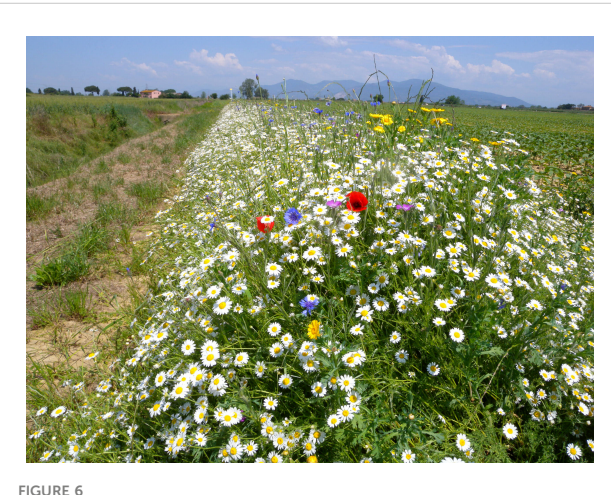
Annual wildflower strip sown in a cultivation of winter wheat at Lavoria, Pisa (Italy). The species are Centaurea cyanus L., Papaver rhoeas L., Anthemis cotula L., Agrostemma githago L., Glebionis coronaria (L.) Cass. ex Spach (Photo S. Benvenuti).

In Australia the main focus has been on returning native plants to the urban environment and on restoring native vegetation. In fact, Australian flora has high endemicity, and the issue of naturalisation of non-native plants is very acute.