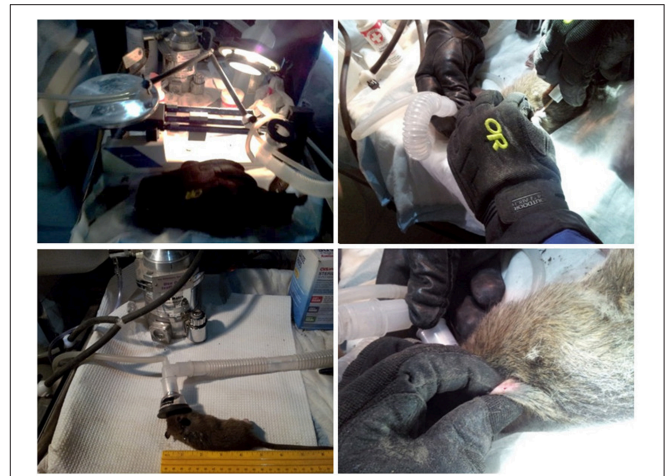
FIGURE 2 | Surgical table and implant procedure for wild Norway rats, Rattus norvegicus , captured on Eastern Long Island and monitored from January 14–May 15.