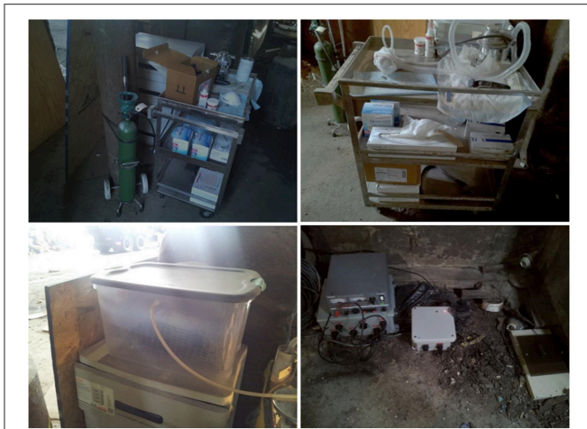
FIGURE 1 | Mobile anesthetic lab and outdoor RFID system for wild Norway rats, Rattus norvegicus , captured on Eastern Long Island and monitored from January 14–May 15.