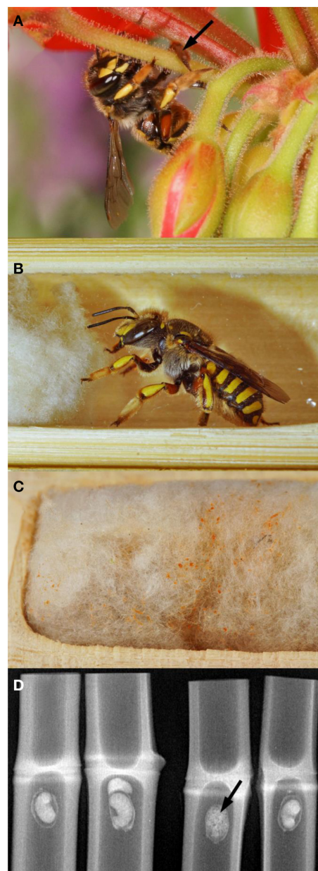
FIGURE 1 | (A) Female Anthidium manicatum collecting secretions from trichomes on Pelargonium flower petioles in a flight cage using specialized hairs on tarsi (arrow). (B) Female returning to uncoated brood cell made of plant hairs (wool) in a bamboo internode. (C) Woolly brood cell coated with Pelargonium secretions visible as orange spots. (D) X-ray scans of brood cells taken during the exposure experiment. Three cells contain healthy larvae (prepupae), but one (arrow) was found to be parasitized by Melittobia wasps when dissected at the end of the experiment.

in the bamboo internodes (see Lampert et al., 2014). Females in the respective cages were regularly observed to collect trichome secretions from flower petioles and buds of Pelargonium , and reddish coatings were visible with the bare eye on ~70% of brood cells ( Figure 1 ). Bamboo internodes with completed nests were removed upon completion. Twenty-four separate nests with a