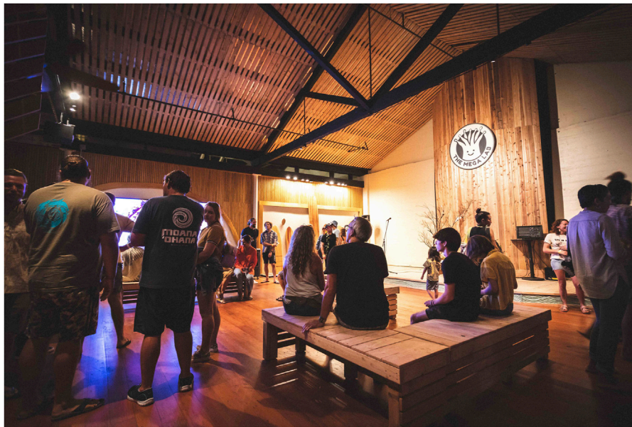
FIGURE 1 Previously an early-century furniture store, the MEGA Lab now occupies the second floor of the Mokupapapa Marine Discovery Center. Open to the public at no cost, it provides opportunities for visitors to engage in scientific observation, communication, and exploration.