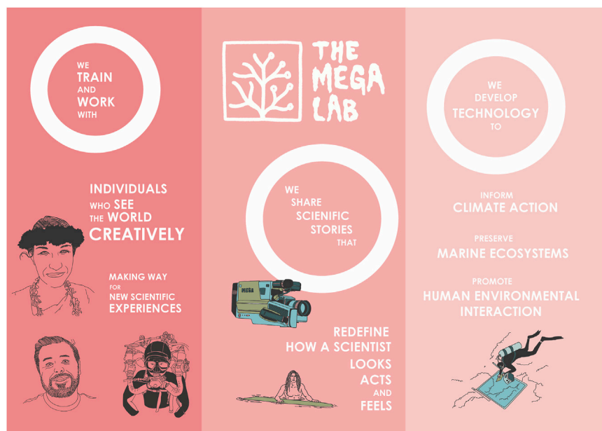
FIGURE 2 The Multiscale Environmental Graphical Analysis (MEGA) Lab focuses on scientific training, communication, and research through the use of multimedia, branding and original artworks.

ocean research, with storytelling focused upon projects related to the changing climate, marine ecosystems, and the interactions between humans and the environment. To achieve its goals, MEGA Lab supports, trains, and partners with creative individuals to develop new ways to protect the planet and the communities that inhabit it. By emphasizing storytelling in brand development, MEGA Lab can