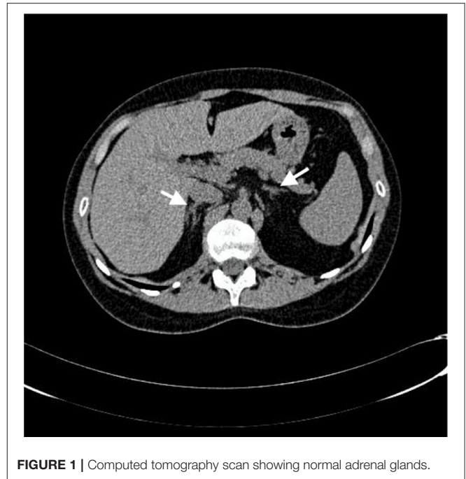
FIGURE 1 | Computed tomography scan showing normal adrenal glands.

Work-up revealed an 8 a.m., serum cortisol of 6 µg/dl after 1 mg overnight dexamethasone suppression test (DST). Further work-up showed two consecutive elevated 24-h urinary free cortisol (UFC) (>510 µg/day and >485 µg/day, normal 20–90). The morning plasma adrenocorticotropic hormone (ACTH) was suppressed (<1 pg/ml, normal 7.2–63.3). These findings were consistent with an ACTH-independent Cushing's syndrome. She had normal complete blood count, LFT, KFT, and serum electrolytes. Lipid profile showed total cholesterol of 213 mg/dl, triglycerides of 90 mg/dl, HDL-C of 49 mg/dl, and LDL-C of 159 mg/dl. She was diagnosed with impaired fasting glucose (FPG of 104 and 109 mg/dl). Adrenal computed tomography (CT) scan showed no nodules or hyperplasia ( Figure 1 ). With the suspicion of primary pigmented nodular adrenocortical disease a Liddle's test was ordered. During Liddle's test of 6 days (2 days of baseline collection, 2 days of 0.5 mg of dexamethasone orally every 6h, and 2 days of 2 mg orally every 6h) urinary cortisol increased from 71 to 413 µg/day. Basal urine free cortisol levels were within normal values (20–100 µg/day). It was interpreted as an