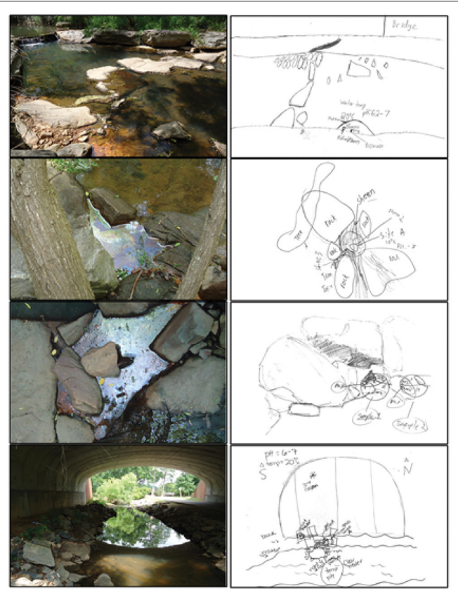
FIGURE 4 | Examples of photos and student participant sketches of the field site.