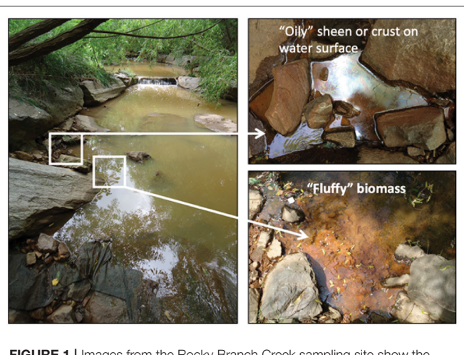
FIGURE 1 | Images from the Rocky Branch Creek sampling site show the "oily" sheen or crust and orange "fluffy" appearance of the biogenic iron oxide and biomass material present, illustrating the macroscopic nature of these deposits.

The postdoctoral researcher involved in the project presented the final third of the presentation focused on an overview of what can be observed and measured in the field, including water temperature and pH, and size and morphology of the iron oxide formations ( Figure 2 ). This was complemented by a description of what can be subsequently analyzed in the lab to give the students a clearer image of how the field-sampling event fits into the bigger scientific study. Methods of growing the iron oxidizing bacteria collected from the stream were shown and different laboratory systems to study the formation of biominerals and how they interact with other chemicals in water were disclosed. The final slides encompassed an overview of the protocol the students would be following at the field site and the proper personal protective equipment (PPE) needed for this type of sample collecting activity.