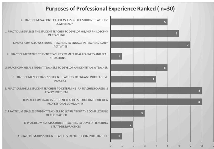
FIGURE 1 | Ranked purposes by total numerical value ( n = 30 ).

participants (one being the most important and ten being the least important). Purpose F: Practicum encourages student teachers to engage in reflective practice ranked four by teacher educators. These findings are important given the investment in program changes and strategic initiatives the Faculty is making toward the professional community approach for professional experience. These findings would suggest that as a result of these views, the success in transitioning to a community model and the attempted reculturing of professional experience will take time to change habits and behaviors embedded in a traditional view of the “teaching practice model.”