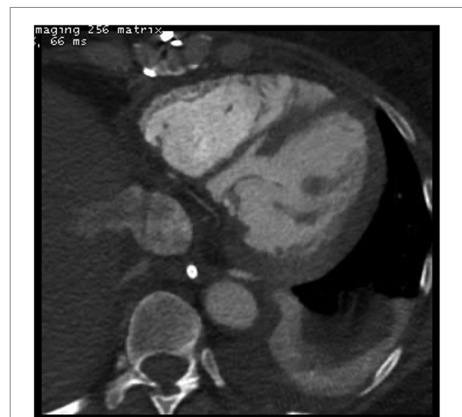
FIGURE 1 Contrast enhanced computed tomography of the chest performed 5 days after surgical repair of ventricular septal rupture (VSR) demonstrated the enlargement of small residual VSR.

In patients undergoing surgical repair of post-AMI VSR, complex and posterior VSR, emergency surgery, early repair, CS with hemodynamic instability, RV dysfunction, and renal impairment are risk factors for a poor outcome (8–11). Almost 50%–70% of patients with post-AMI VSR are in CS at the time of presentation, and more than 50% of these patients die due to multi-organ failure (12, 13).