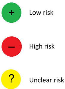
FIGURE 2 | Risk of bias of the included RCTs.