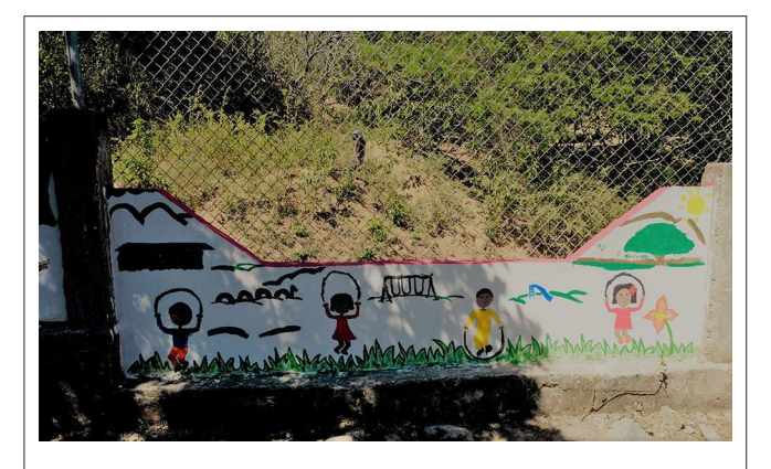
FIGURE 4 | Children jumping rope.