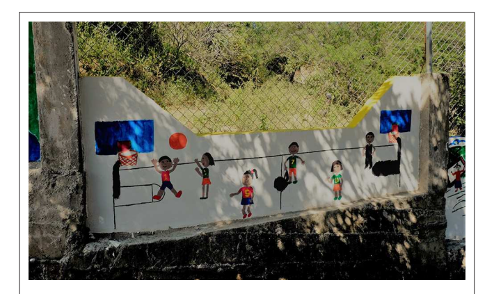
FIGURE 8 | Basketball.