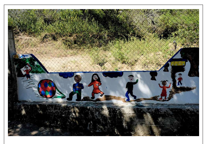
FIGURE 10 | Soccer

Standing in opposition to this specialization is an image of children playing soccer (see Figure 10 ). In this image, we see on the left end a hillside topped by the local water pumping station (a station then-recently installed as a community resource to