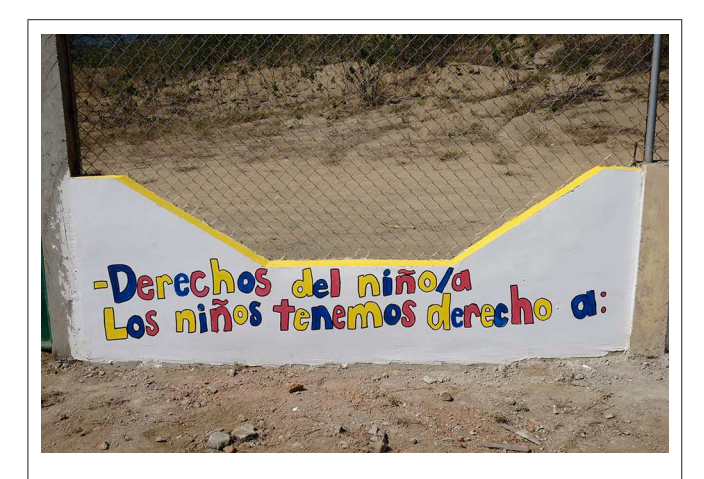
FIGURE 1 | Derechos del Niño/a.