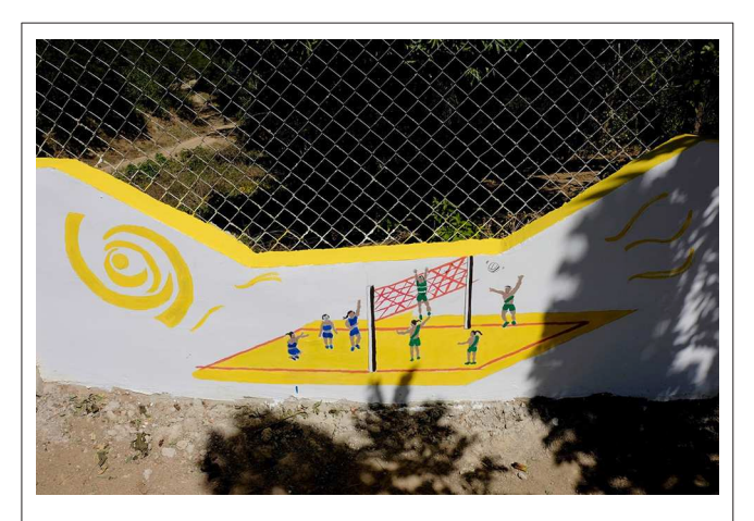
FIGURE 9 | Volleyball.

on two players in red. A girl from the green team shoots the bright orange basketball toward the net. In the volleyball picture (see Figure 9), three players from the blue team are ready to return the shot from the four-person green team. The action here takes place on a bright yellow volleyball court divided by a red net. All teams are mixed-sex. Whereas, all of the other images could contain makeshift or common equipment, these images show specialized equipment and specialized uniforms. This may explain why they do not show the hillside or the school; because they are specialized sports, they may require special places to be played. These pictures, as manifestations of healthy sports show an idealized version of basketball and of volleyball. Although the school does have a single volleyball and a volleyball net that can be stretched over the unpainted concrete forecourt of the school, the school has no uniforms for a team. And, in contradiction to the image painted, the school has no basketball uniforms. In this case, rather than indicating a resource that is present, the children may be exercising agency to call on the school to use its structural resources to provide this additional equipment.