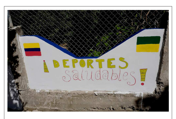
FIGURE 3 | ¡Deportes Saludables!

The second grouping of panels was most strongly informed by the children. For a child to grow up healthy and happy, the children of Chaquizhca thought that children should play "ideportes saludables!" (Healthy Sports!). These nine panels begin with an introductory panel with this phrase (see Figure 3). Sports (deportes) appears in the center in block letters, while the modifier healthy (saludables) is written in red script immediately under it. Both words are framed by exclamation points following Spanish grammar. In the upper left sooner of the panel appears a stylized Ecuadorian flag, while a flag for Calvas county (where the school is located) appears in the upper right corner. The remaining panels illustrate what the children mean by healthy sports.