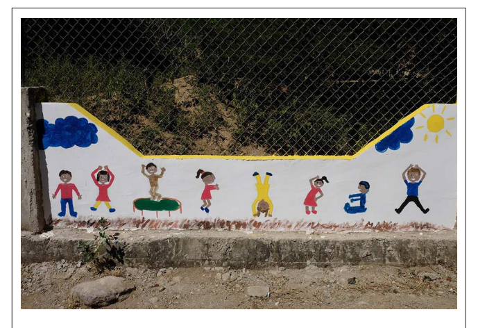
FIGURE 6 | Additional play.

The final panel displaying independent play occurs outside the school (see Figure 7 ). In the center is a girl in pink, riding her bicycle down a path. She has just descended a hill along a long windy path. The hill is largely barren, with a brown dirt road weaving between green land devoid of trees. Two other cyclists are descending the path as well. All three children are headed toward a village on a verdant hill. The green is much brighter and more solid. A bright blue river or road weaves down this hillside. The scene is meaningful in multiple ways. Many of the children take similar journeys each day coming to and from school. Although only a kilometer or so separates