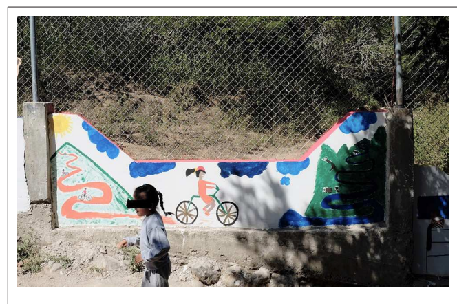
FIGURE 7 | Children cycling.

the schools and homes in a direct line, the rugged hillsides hills require many switchbacks, leading to hours-long journeys each way. The school sits on less productive land, while the homes are on richer land that sometimes has better access to water. The scene drawn by the children reflects, perhaps, more than play. In addition, this panel reflects well how culture shapes the children's understanding of physical health; geography shapes where homes can be placed, and the placement of homes creates the conditions for transportation, and the conditions for transportation then influence how geography itself is navigated. Participating in healthy activities can allow a child the strength to manage this journey each day, and the home structure and geographical structure creates this need for a particular kind of health body.