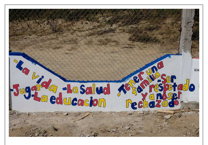
FIGURE 2 | Rights of the child.

abuse appears to be reflected in the right "ser respetado y a no ser rechazado" (to be respected and not rejected). Other terms from the Convention, however, are not included on the wall, such as the Convention's assertions that no child may be enslaved or suffer capital punishment. Just because the teachers and the children did not include these, however, does not mean that they would accede to slavery or to the death penalty. Instead, the children expanded the list of rights. We see that the children engaged in a dialogue to include other rights not contained in the Convention. The children also claimed the right to health (la salud), to play (jugar), and to education (la educacion). There is some slippage, perhaps intentional, between the rights that are demanded from a human rights perspective and those that are demanded by members of the community. In any case, the listing of rights, colored with the hues of the Ecuadorian flag, may make these rights present and localized, and, in turn, may make children and parents more aware of the inherent rights of the child for social health. That is, by tying together the resources provided by the world (the Convention) and the nation (the flag), the children and their teachers wove their rights, using an agentic voice, into two already existing powerful structures.