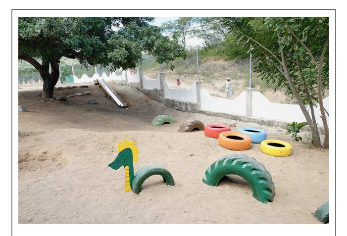
FIGURE 5 | Dragon on the playground.