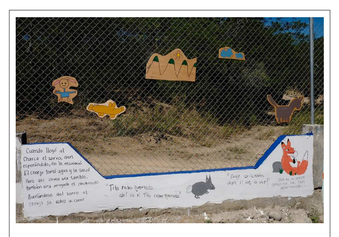
FIGURE 11 | Fox and Rabbit.