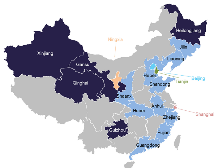
FIGURE 1 Location of sampling sites in China.

mass spectrometer with electrospray ionization (ESI) source (Thermo Fisher Scientific, Waltham, USA). Chromatographic separation was performed on an C_{18} column (100 mm \times 4.6 mm, 2.7 \mu m) at 40°C. The mobile phase rate was 0.3 mL/min and the gradient elution program was described in Table S2. The antibiotics were detected by multiple reactions monitoring (MRM) mode with an electrospray ionization (ESI + ) source and the injected volume was 10 \mu L. The spray voltage was 3700 V with 320°C of capillary temperature. The sheath gas and auxiliary gas flow rate were 30 psi and 15 psi, respectively. Details on antibiotic mass spectrometry conditions are available in Table S3. All the operation, data acquisition and analysis were controlled through the Thermo Xcalibur 3.1.