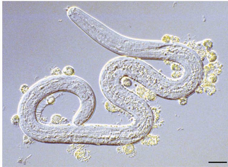
FIGURE 1 | Granulocytes attaching and degranulating on the surface of larval O. volvulus recovered from a diffusion chamber, implanted in mouse immunized with irradiated O. volvulus third-stage larvae, reprinted from Abraham et al. (2002), with permission.

experimentally to investigate their vaccine efficacy and commercially to produce veterinary vaccines against canine ancylostomiasis (hookworm infection) (Steves et al., 1973) and bovine dictyocaulus lungworm infection (McKeand, 2000). UV-irradiated Ascaris suum eggs containing the infective larvae also induced significant protective immunity against a challenge infection (Urban and Tromba, 1984). They provide an early indication for the feasibility of larval antigens to induce protective immunity for human helminth infections, and this strategy was adopted as an initial approach for a human hookworm vaccine initiative (Schneider et al., 2011).