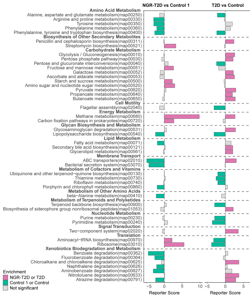
FIGURE 3 | Differential enrichment of functional pathways. Left: differential enrichment between NGR-T2D ( n = 30 ) and control 1 ( n = 30 ) group. Right: differential enrichment between Chinese T2D patients ( n = 60 ) and healthy controls ( n = 60 ). X-axis represents reporter score. NGR-T2D: participants had normal glucose regulation at stool collected, and they developed T2D in the follow-up.

In this study, we compared gut microbiota in normoglycemic individuals and followed them after 4 years and demonstrated that the gut microbiota had already changed in the healthy individuals before they developed T2D. These individuals showed a significantly decreased abundance of Bifidobacterium longum , Coprobacillus unclassified , and Veillonella dispar , and increased the abundance of Roseburia hominis , Porphyromonas bennonis , and Paraprevotella unclassified . Among these, Bifidobacterium is the most studied species as a probiotic. Previous studies have reported that Bifidobacterium abundance was decreased in T2D participants (Sedighi et al., 2017; Gonai et al., 2017; Sroka-Oleksiak et al., 2020). Metformin increased the relative abundance of Bifidobacterium adolescentis (Rodriguez et al., 2018), and acarbose increased the gut content of Bifidobacterium longum in T2D patients (Su et al., 2015). In addition, Roseburia hominis , a butyrate-producing bacteria, has recently been shown to exert the immunomodulatory properties