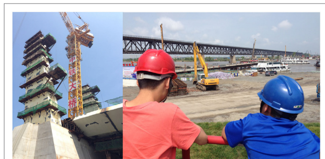
FIGURE 1 | New bridge construction in China: (left) Benxi (Liaoning province); (right) Harbin (Heilongjiang province).

Collaboration between different countries in civil engineering topics benefits researchers and engineers globally. For example, the reuse of the latest existing design code in a new discipline adapted in one country could significantly reduce the time and cost of addressing the same technical and regulatory questions in other countries. Furthermore, new codes in different countries can achieve higher quality if the editors and regulatory agencies capture and incorporate the knowledge, experience, and lessons learned by other countries (Pucher, 1995a,b; Dave and Koskela, 2009). In the last two decades, different countries have implemented successful long-term SHM systems on bridges of different types, length, and significance: the Confederation Bridge in Canada (Cheung et al., 1997); the Tsing Ma Bridge in Hong Kong (Lau et al., 2000); and the Commodore Barry Bridge in the United States (Barrish et al., 2000). In addition, real-time monitoring systems (Ko and Ni, 2005) have been installed in a number of bridges in China, including the Zhanjiang Bay Bridge (Wang, 2004); the