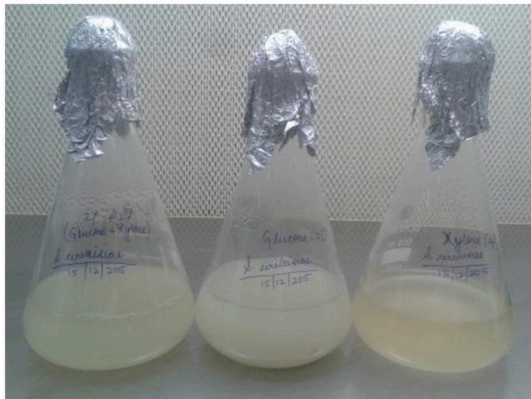
FIGURE 3 | Growth of S. cerevisiae LN on xylose, glucose and mixed substrates in minimal medium.

glucose and xylose) in the medium, utilization ranged from 70 to 90% with different transporters (de Sales et al., 2015).