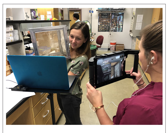
FIGURE 1 | Behind the scenes of Scientist Online. An entomologist shows a mosquito cage to students participating via Skype.

On the production days (see Figure 1 ), equipment included: (a) a laptop on a cart with a head and shoulders, medium framed shot of the scientist during the call, (b) an iPad used for close ups of the props and to follow the scientist around the lab, (c) a microphone clipped to the scientist, and (d) headphones attached to the iPad in order to avoid audio feedback between devices. It is important to note that our team used two separate Skype accounts in order to have both devices logged in simultaneously during the calls. Scientists used props including